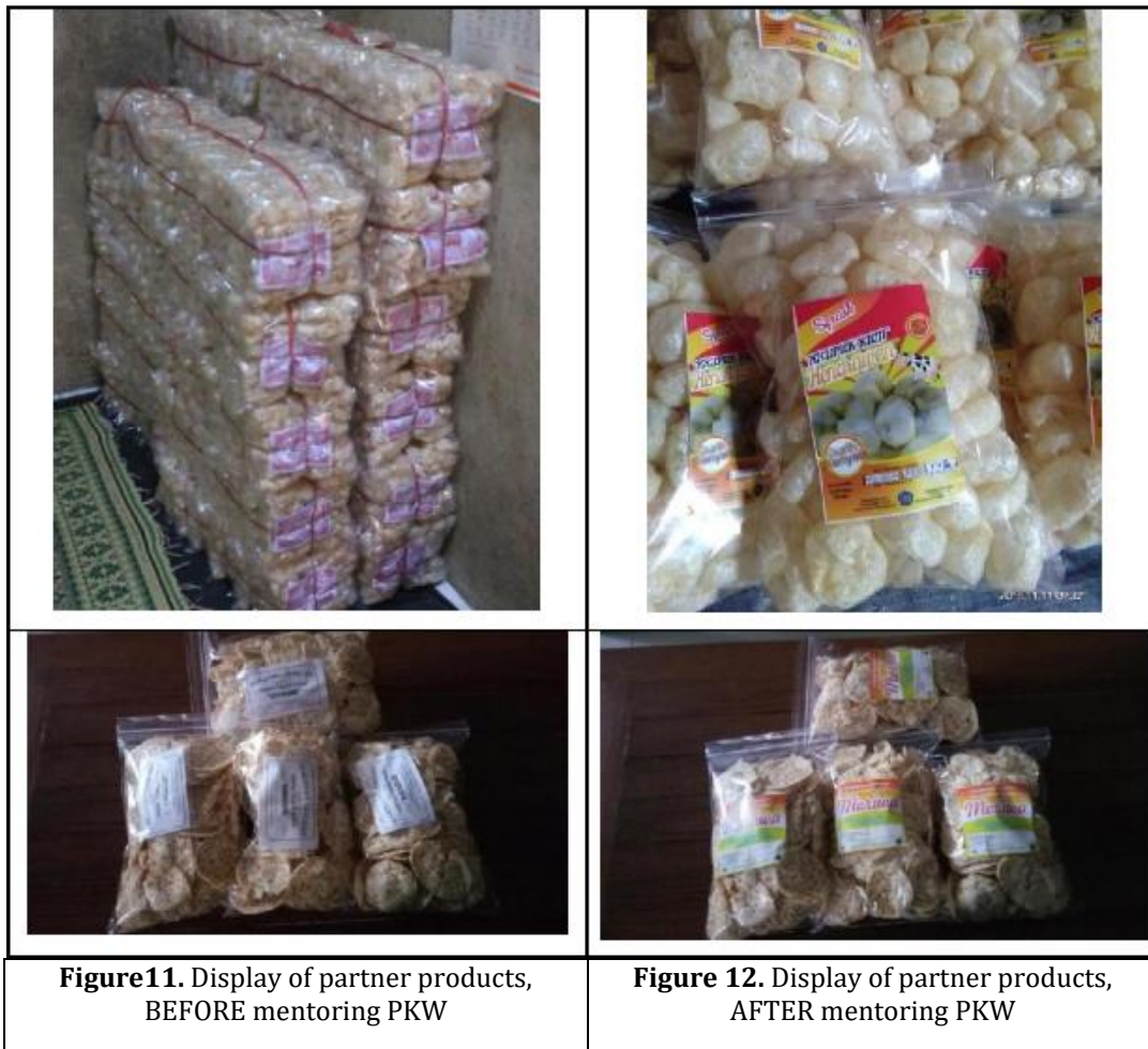
Figure11. Display of partner products, BEFORE mentoring PKW