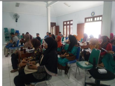
Figure 6. Practice of making processed bread and rengginang from cassava flour

From this activity PKK groups in the villages of Kebak and Ngunut, Jumantono sub-district have been given training and practice in making rengginan, bread and biscuits to develop and increase the added value of cassava. Assistance for packaging design, product promotion and marketing still needs to be done, because PKK groups and community groups that are fostered do not have entrepreneurial skills.