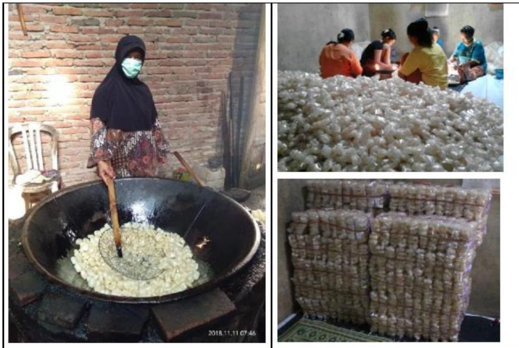
Figure 10. The frying process and packaging of cow skin rambak products