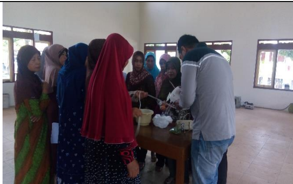
Figure 5. Practice of making processed cassava products

and biscuits. The production and development of various processed cassava products aims to increase the economic value and added value of raw cassava which has been produced so far